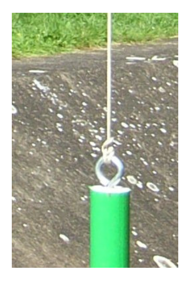
EXAMPLE OF A SIDE TIED POLE. TO BE AVOIDED.

EXAMPLE OF A CENTRALLY HUNG POLE. WITH A SCREWED EYE.