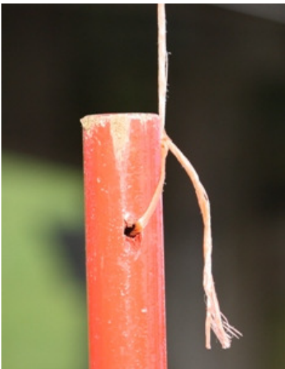
EXAMPLE OF A SIDE TIED POLE. TO BE AVOIDED.