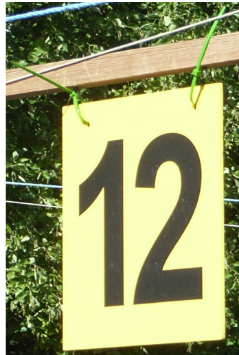
EXAMPLE OF A FREE MOVING NUMBER BOARD.