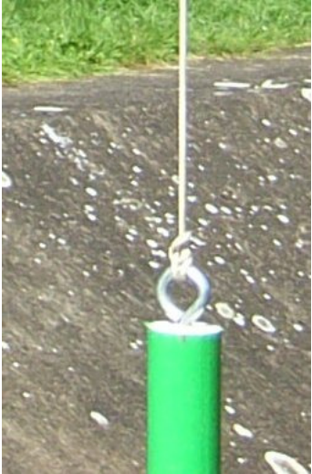
EXAMPLE OF A SIDE TIED POLE. TO BE AVOIDED.